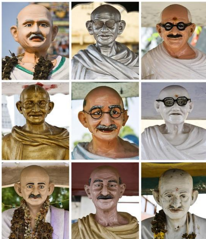
Vivek Vilasini, 'Vernacular Chants II', 2007. Composite photograph, 37.5 x 33 inches.

In a short text from 1928 titled “Against the Synthetic Portrait, For the Snapshot”, Russian constructivist Alexander Rodchenko rejected the growing desire among artists to memorialize Lenin in a single iconic image, preferring instead the unstable composite portrait of the revolutionary leader that would emerge from a collection of snapshots. Vivek Vilasini’s Vernacular Chants II (2007), a critique of Gandhi as icon in postcolonial India, espouses a similar ethos. A 3 by 3 array of straightforward frontal photographs of the head and shoulders of commemorative statues of Gandhi from across India, Vilasini’s piece challenges the lure of the icon at the level of both apparatus and image. Though typologically similar, the individual statues vary greatly in materials, style and sophistication. By foregrounding photography’s inherent reproducibility and highlighting difference through repetition, Vilasini’s composite privileges the copy over the original, shattering the idealized, iconic Gandhi and distributing his saintly aura across the many similar but distinct representations. And by privileging vernacular interpretations over State-sanctioned heroic representations Vilasini’s portrait rejects the latter as an appropriate mode for memorializing Gandhi. What emerges in the place of an icon is instead a sociological portrait of India, each statue reflecting the political allegiances, economic means and vernacular aesthetics of the community that sponsored it.