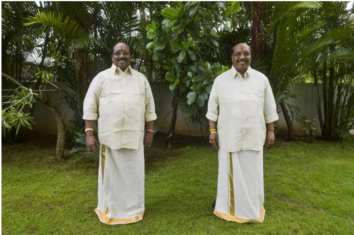
Anup Mathew Thomas, 'Ambassadors', 2007. Archival ink-jet print on Hahnemuhle photo rag paper, 53.5 x 36.2 inches.